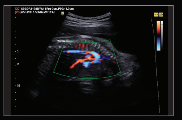
Aortic arch view with S-Flow™