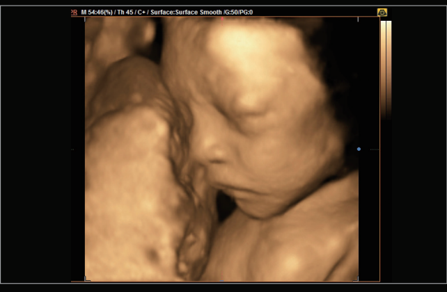
Fetal face in 3D mode