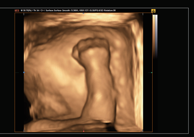
3rd trimester fetal hand 3D