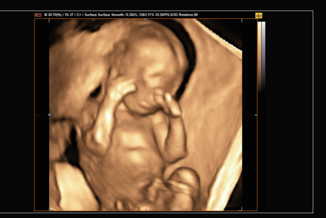
2nd trimester fetal face 3D