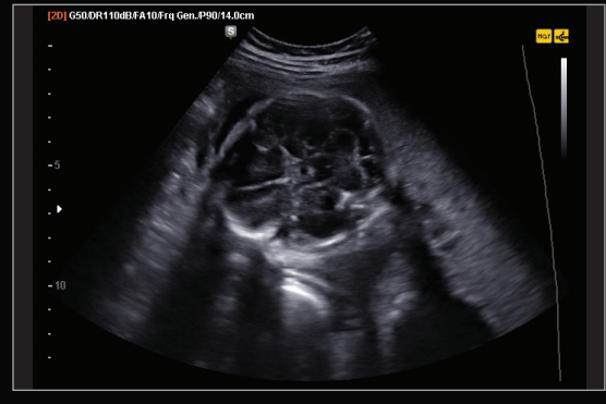
Fetal brain with ClearVision