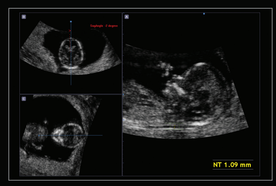
Fetal NT thickness measured with Volume NT