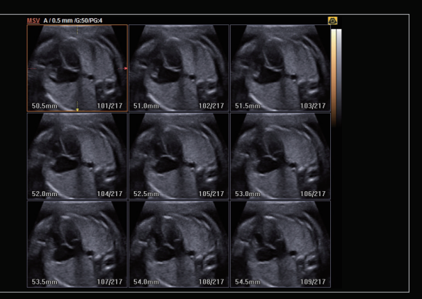
Fetal heart with MSV